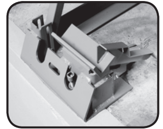
Front SafeTFrame® Pedestal